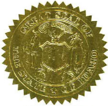
PHIL MCGRANE SECRETARY OF STATE

This Executive Order shall take effect immediately upon issuance.